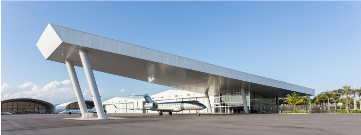
Headquarters: Fontainebleau Aviation, Miami-Opa locka Executive Airport, FL - USA