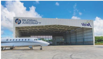
Salvador, BA – Brazil Hangar Vem Aviation