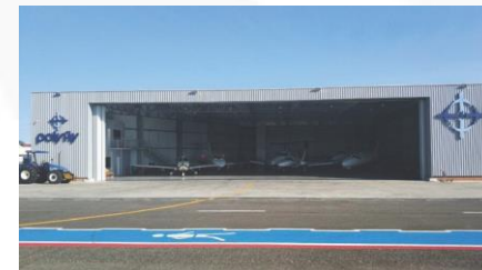
Navegantes, SC – Brazil Hangar PolyFly