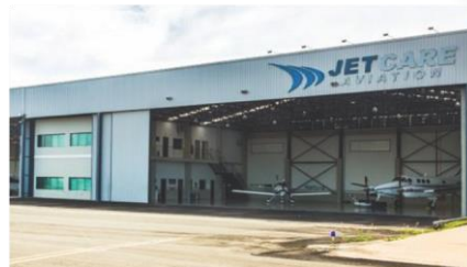
Sorocaba, SP – Brazil Hangar Jetcare Aviation