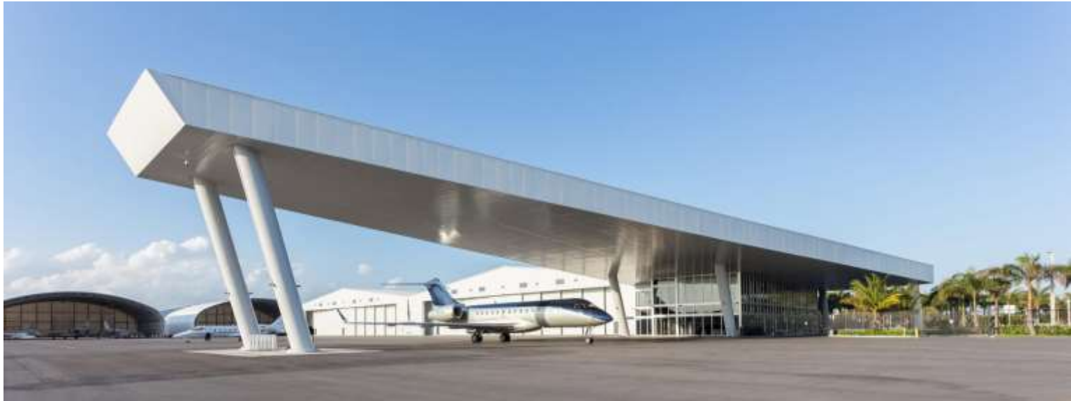
Headquarters: Fontainebleau Aviation, Miami-Opa locka Executive Airport, FL - USA