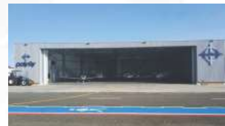
Navegantes, SC – Brazil Hangar PolyFly