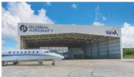
Salvador, BA – Brazil Hangar Vem Aviation