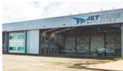
Sorocaba, SP – Brazil Hangar Jetcare Aviation